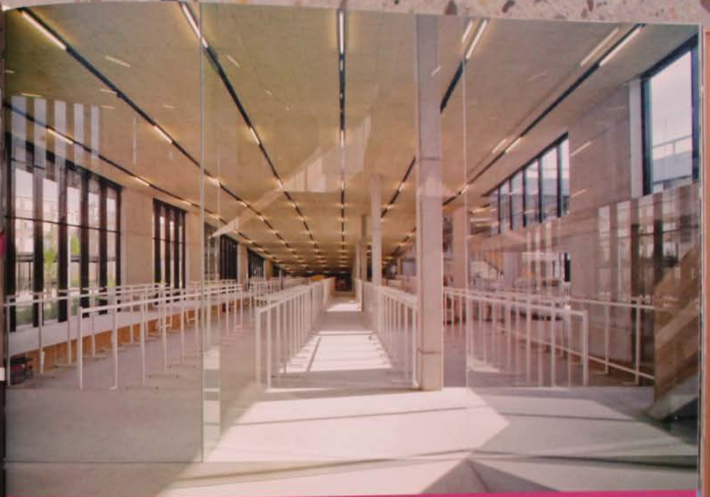
From left to right, from above to below: Reception area, Interior view from the upper floor, Exterior view, Right: Interior view.